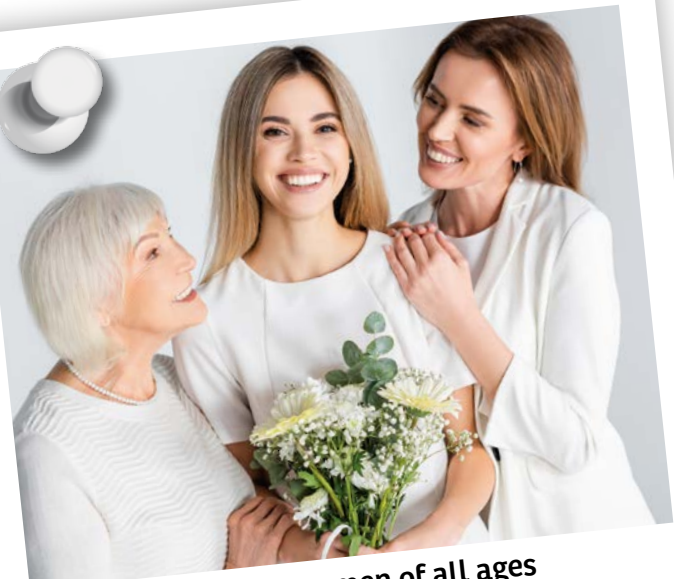
March 8 th : a day for women of all ages

► International Women's Day is on March 8 th . It celebrates the work that women do. In some countries it's an official holiday, in others it's a normal working day. In some countries, women get half a day off 6 work, or a flower. In the United Kingdom people go to theatres and discussions. There are also special fun runs.