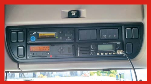
This one is under the roof. Each driver inserts a special card in it.

Professional drivers have to be careful about how many hours they drive and how much time they relax. They have special devices<sup>12</sup> that check<sup>13</sup> this.