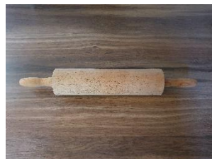
b. a rolling pin