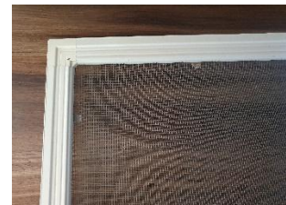
c. a drainer