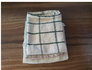
a. tea towel(s)